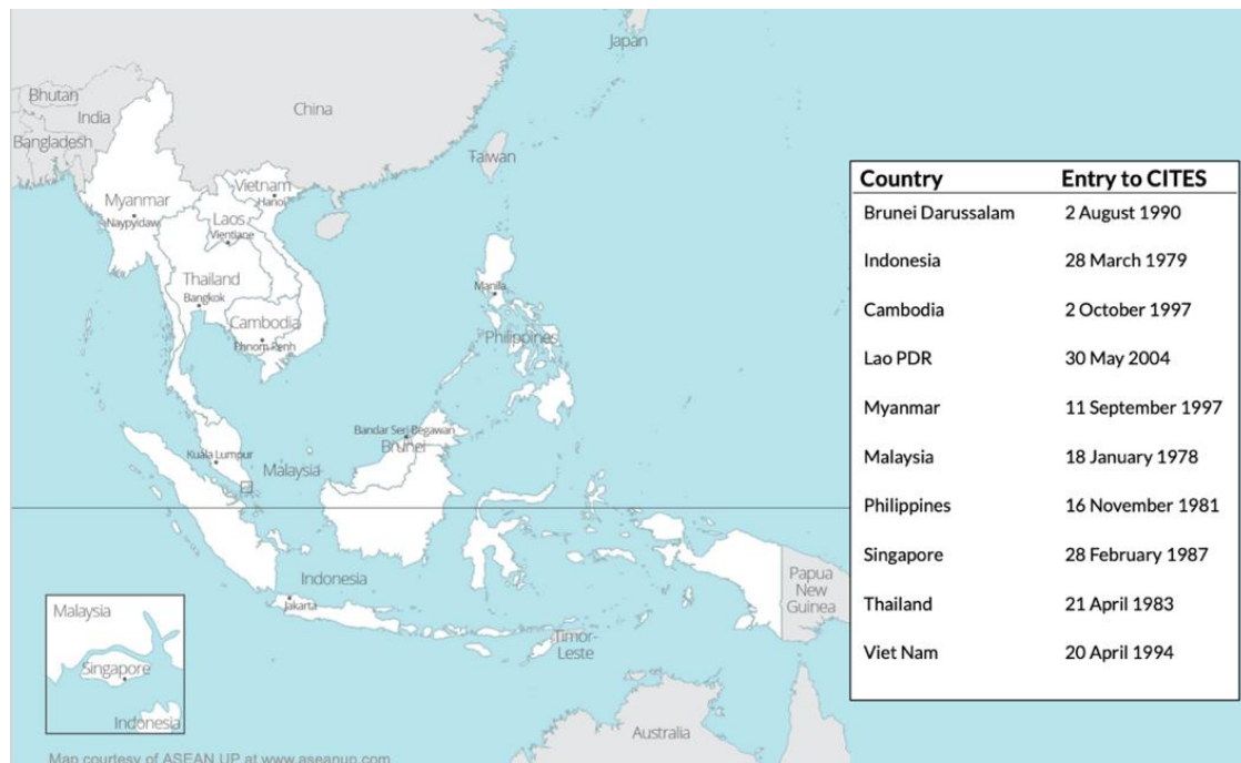
Figure 1. Southeast Asian countries and accession to the Convention on the International Trade in Endangered Species of Wild Fauna and Flora (CITES.) (Map courtesy of ASEAN UP via aseanup.com. CITES data retrieved from CITES.org ).

have been reports of confiscated animals sold to other countries and registered on annual reports as legal trades [44]. Selling confiscated animals can even comply with CITES guidelines through the justification that it can ‘provide a means of disposal that helps offset the costs of confiscation’ [18]. D’Cruze and MacDonald [8] have brought attention to the lack of comprehensive live animal confiscation records within the CITES Trade Database. They highlighted a knowledge gap and helped bring into question whether countries are properly handling live confiscations. Though the international efforts to stop the illegal wildlife trade have increased, with more live animals being successfully seized, in many cases, recovered individuals may face equally bad or even worse outcomes [24].